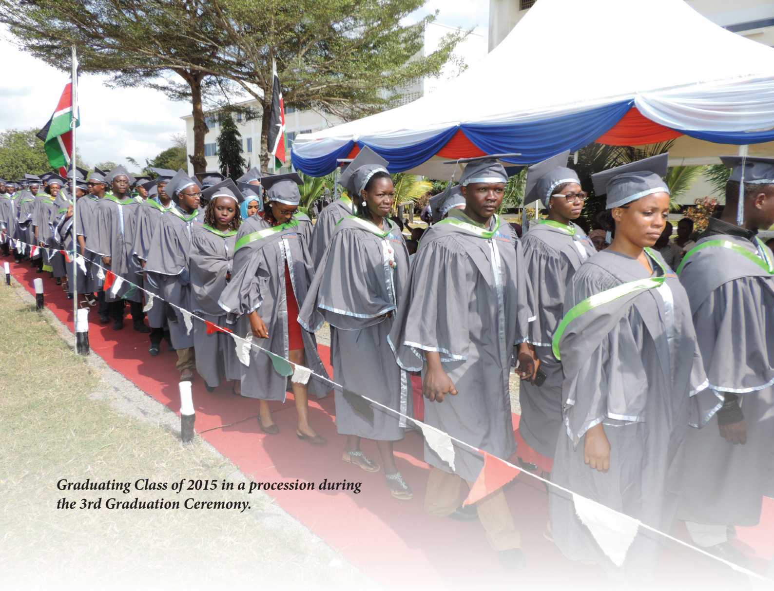
Graduating Class of 2015 in a procession during the 3rd Graduation Ceremony.