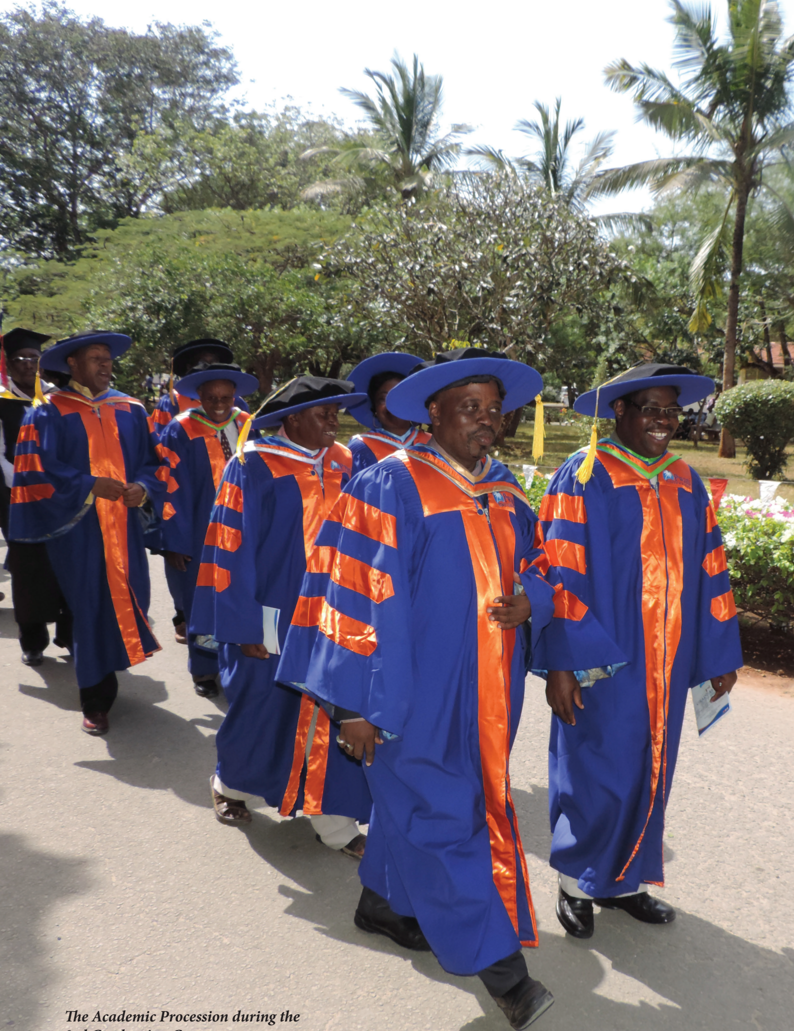
The Academic Procession during the 3rd Graduation Ceremony.