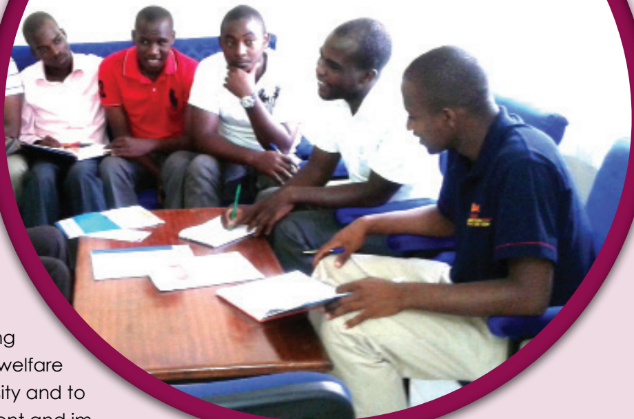
Interim officials of PU Alumni at a past meeting

The Alumni Association, among other activities, supports the welfare and progress of Pwani University and to participate in the enhancement and improvement of intellectual and material well being of Pwani University community.