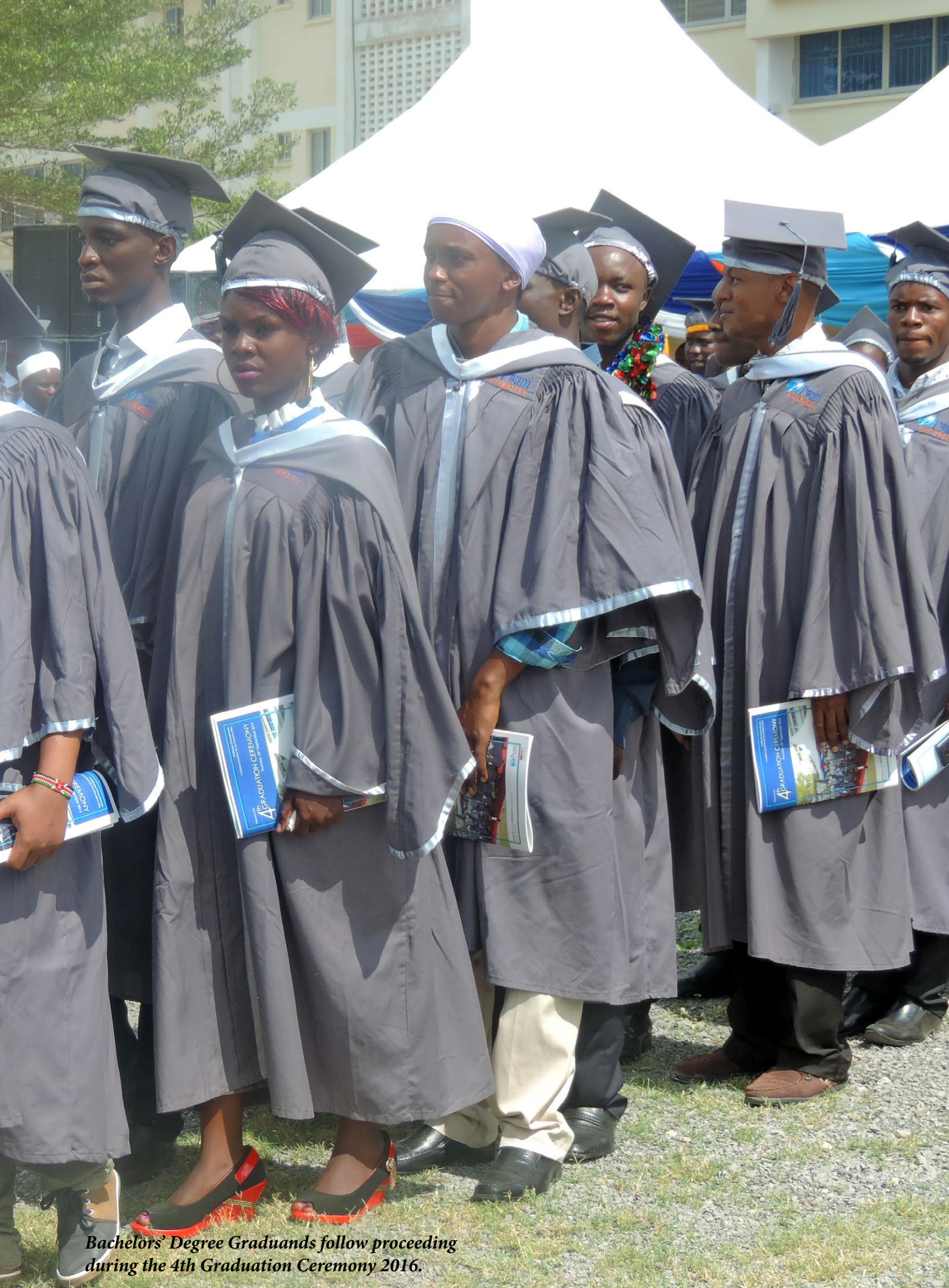
Bachelors' Degree Graduands follow proceeding during the 4th Graduation Ceremony 2016.