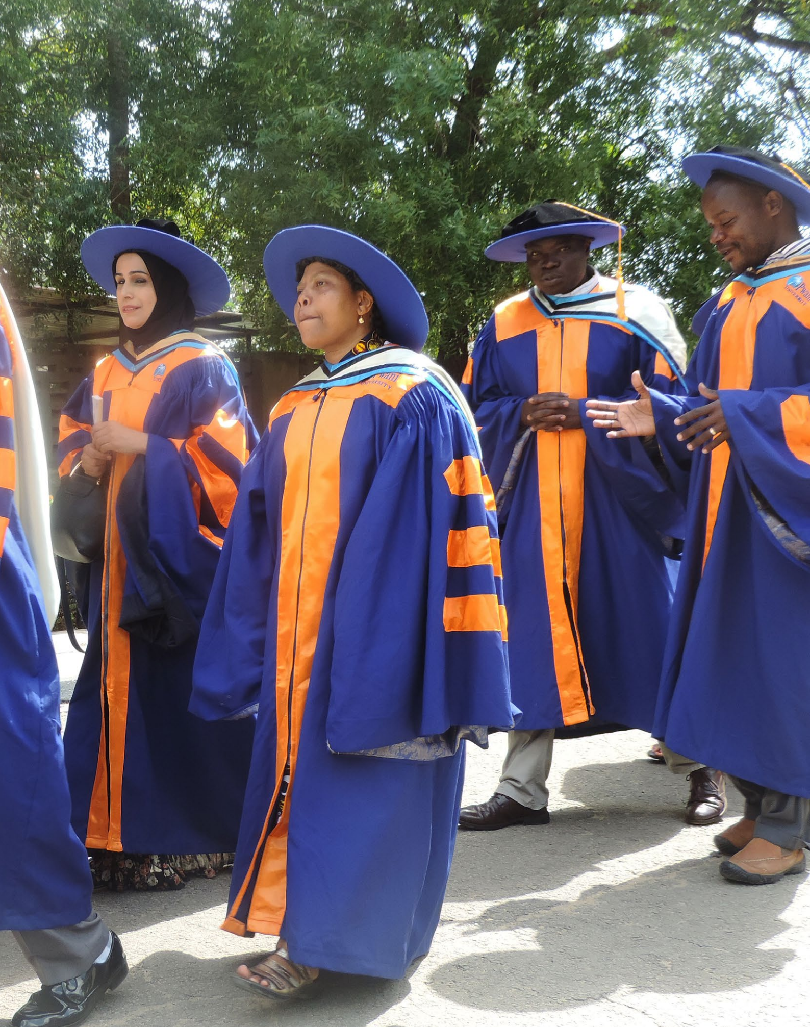
A Graduation Procession during the 4th Graduation Ceremony 2016.